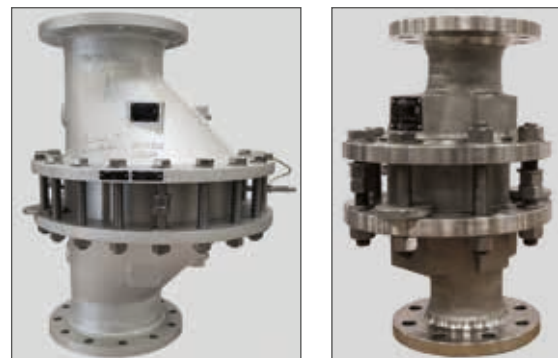
Bi-directional in-line detonation flame arrester, short-time burning proof KITO® EFA-Det4-...-.../...