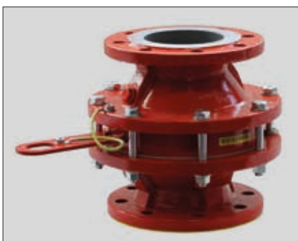
Bi-directional in-line deflagration flame arrester, endurance burning proof KITO® INE-DB-I-.../...