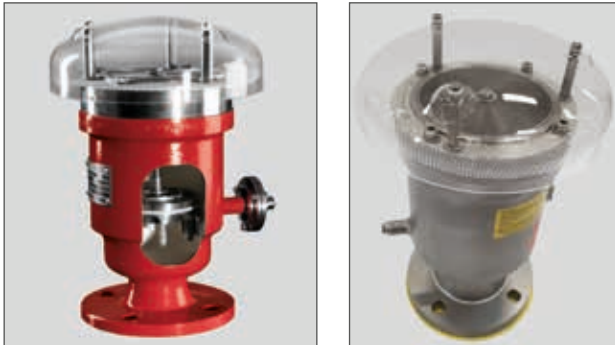
Deflagration- and endurance burning proof pressure and vacuum relief valve KITO® VD/KS-IIA-....