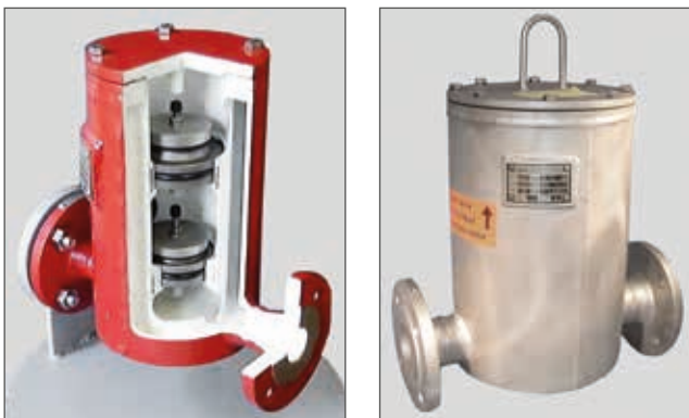
KITO® Pressure and vacuum relief valve VD/TG-...