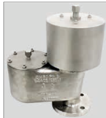
KITO® Pressure and vacuum relief valve VD/oG-...